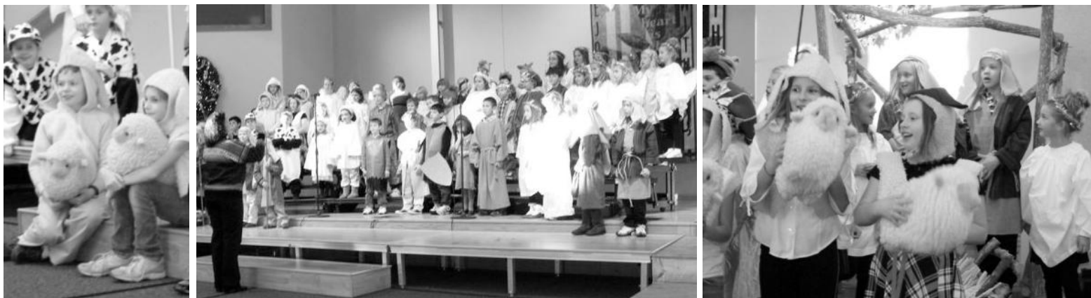
A big THANK-YOU to all the other volunteers who assisted with costumes, sign-in, refreshments, and countless details at rehearsals! You are a wonderful team and the children and families are blessed by your generosity!