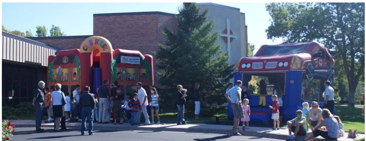
"WELCOME HOME TO WORSHIP" — SUNDAY, SEPTEMBER 12TH, 2010