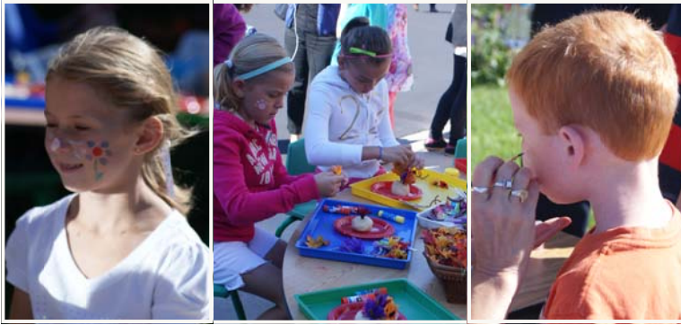
Left: Photos from Welcome Home to Worship Sunday, Sept. 12th